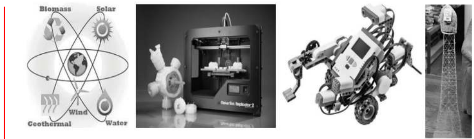
Image from the left, Energy, 3D printer, Robotics and Tower